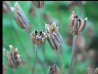
Seed Held in Bracts