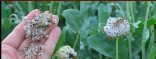
Wind Blown Seed