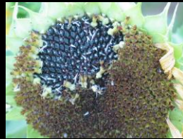
Seed Held in Head