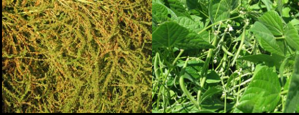
Seed Held in on Stalk or in Pod