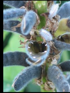
Seeds that Shoot