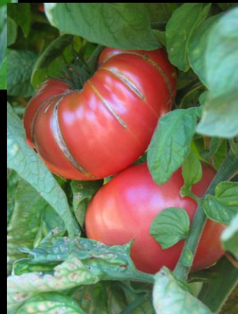
Seed in Fruit