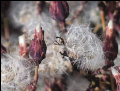
Seed Dropped when Mature