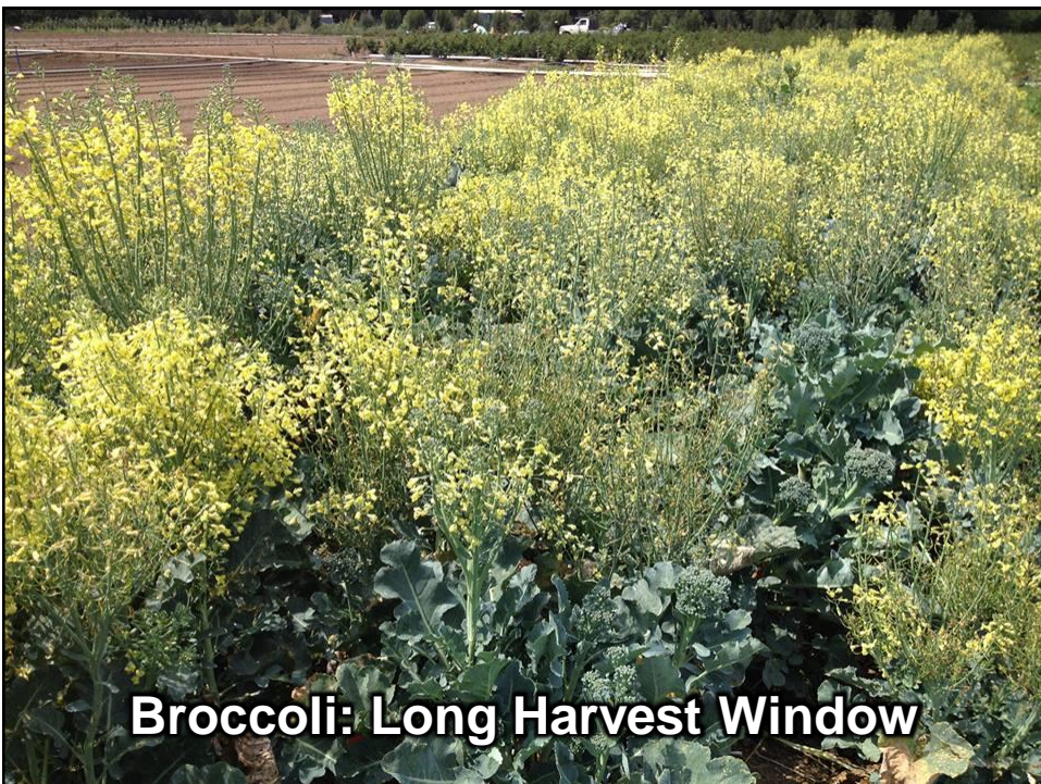
Broccoli: Long Harvest Window