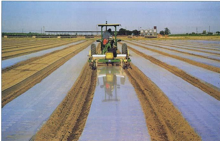
Fig. 1. Transparent polyethylene film is applied to solarize a field on an organic vegetable farm in the San Joaquin Valley. (From Stapleton et al., 2000).