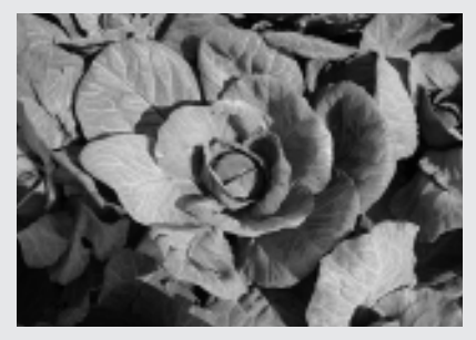
Picture A – Variety A shows a red cabbage type with a more outspoken difference between the outer, older, planophile leaves with a strong weed-suppressive ability and the inner, younger erectophile leaves.

Next to the observations of quantitative traits (plant height, mass, dry weight, disease infection, etc.) as important aspects of selection or assessing the breeding progress, breeders usually also perceive and assess the total impression of plants, and that can be seen as an aspect of the integrity of plants. Breeders develop such a way of perceiving on the basis of a personal relationship with their plant object, based on their former and recent experiences and observations of plant performances in the field. Perceiving a specific kind of 'wholeness' indicates that plants are more than the sum of isolated characteristics that can be registered by computers. The appreciation of the perception of wholeness of a plant depends on the breeder's individualised inner view of plants and on a personal, basic attitude towards nature. It comprises more than merely aesthetic characteristics or agronomic value. It can lead to extra parameters on the basis of experiential knowledge. These extra parameters may be related to the spread in quality, disease tolerance, etc. It has to do with what breeders call 'the breeder's eye' after years of personal dedication to and relationship with his breeding object/crop, constantly comparing